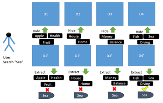
Fig. 2 The concept of proposed method

The paper proposes a multi-user multikeyword searchable encryption scheme means a group of owner-defined users can access the documents that the document owner upload to the cloud using multi-keyword search. In this scheme, document owner uses the concept of histogram shifting [8] to embed keywords into the encrypted text document. Because the cloud server only compares the keywords key-in to the keyword hide in the document instead of decrypting all cloud storage in the phase of query, the scheme improves process efficiency. The following of Figure 2 describes the concept of our proposed method: